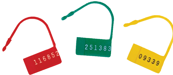
Safety Control Seals with numbers #484107