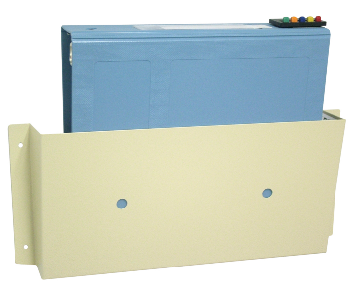
Wall Pocket Vinyl CLAD #255714