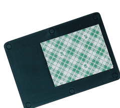
Pressure Sensitive #224126